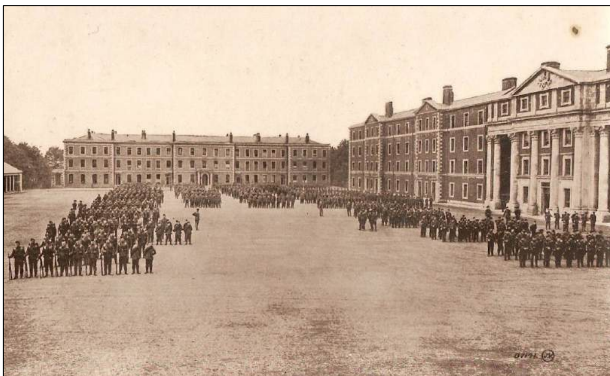
The 11 th Service Battalion Kings Royal Rifles (KRR) Formed at Winchester in September 1914 as part of the 59 th Brigade in 20 th (Light) Division.